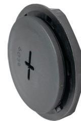
Threaded Plug and Locknut (See Part Number)