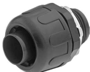
Liquid Tight Compression Fitting for Flex Non-Metallic Conduit Size NPT 1 For Conduit Ready Config. P/N: CF-FLCND-1