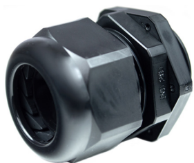
Medium Compression Fitting Supports Cable O.D.: 0.29"-0.60" For Standard Config. (P/N: CF-MD)