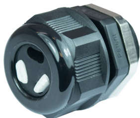
Three Slot Flat Drop Compression Fitting with Removable Spacers For Standard Config.(P/N: CF-3S-FD)