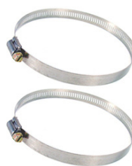
15" Diameter Pole Mount Straps For Use with Pole Mount Bracket P/N: PMB-STRAPS