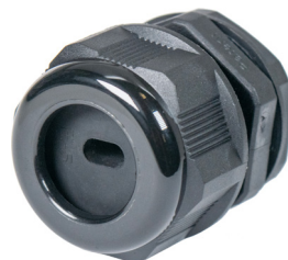
Flat Drop Compression Fitting For Standard Config. P/N: N3/4"B-H1-(8.1*4.5)