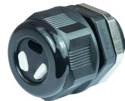
Three Slot Flat Drop Compression Fitting with Removable Spacers P/N: CF-3S-FD