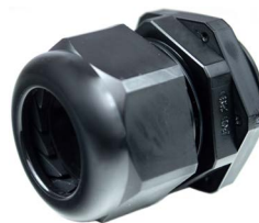
Medium Compression Fitting Supports Cable O.D.: 0.25"-0.49" P/N: CF-MD