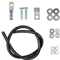
Grounding and Bonding Kit P/N: AWMGB-KIT