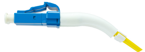
50° Angled Boot Connector