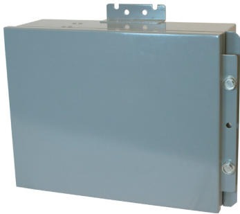
NEMA 4 Rated 4X Wallmount Enclosure