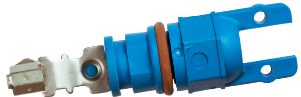
18 mm ECAM Connector