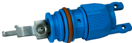
12 mm ECAM Connector