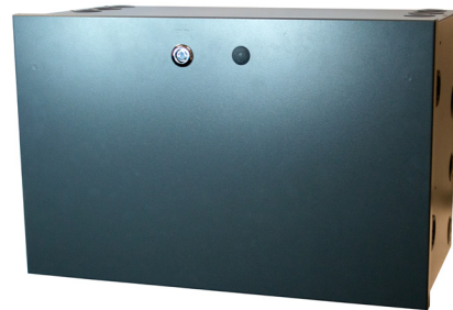
OSEC 4 Wallmount Enclosure (12 mm ECAM only)