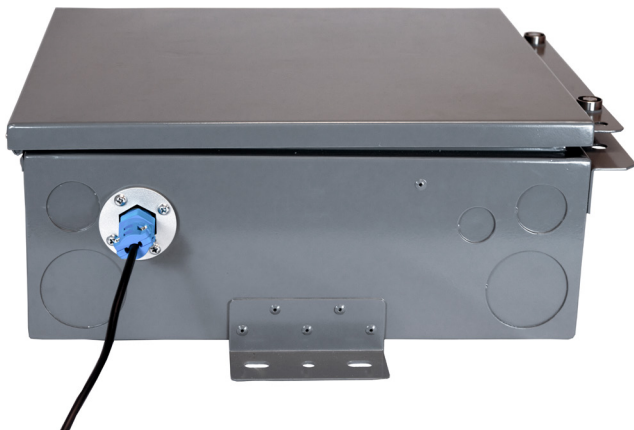
ECAM installed on an ARIA NEMA 8X Wallmount Enclosure