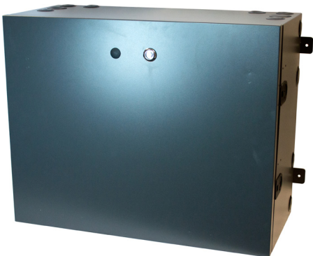
OSEC 8 Wallmount Enclosure