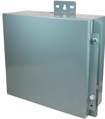
NEMA 4 Rated 8X Wallmount Enclosure