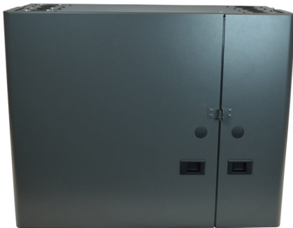
AWM 18 Wallmount Enclosure