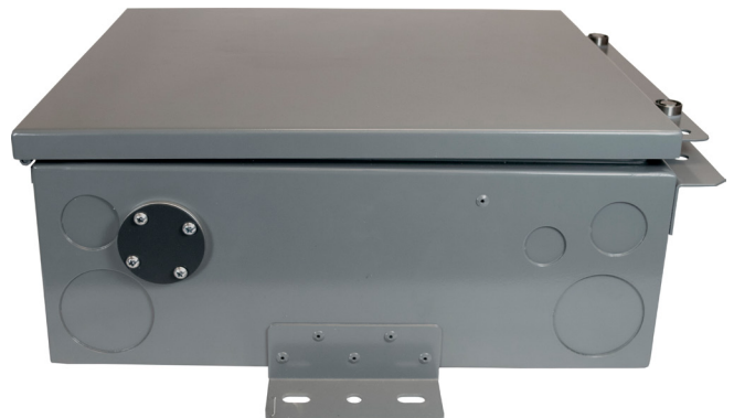
A cover plate is installed when an ECAM is not used