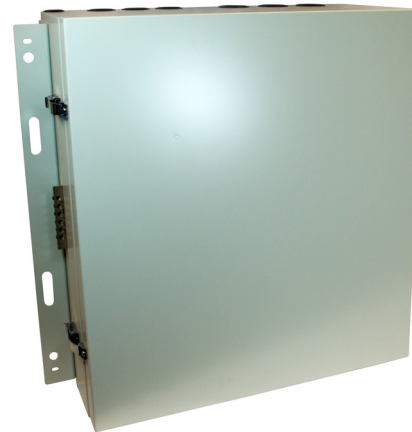
OSEC 12 Wallmount Enclosure