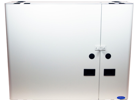
AWM 8 & AWM 12 Wallmount Enclosure (12 mm ECAM only)