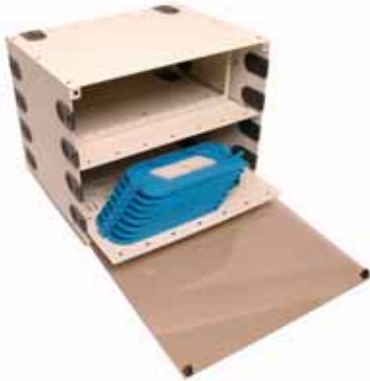
FRM-8.5RU-12X-PS (Includes 1 splice tray)