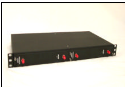
1U Rack Mountable Chassis (holds 2 cassettes)