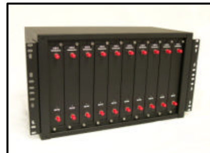
6U Rack Mountable Chassis (holds 10 cassettes)