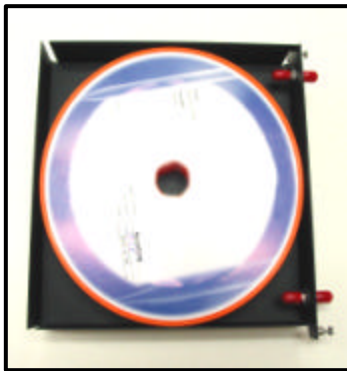
Interior view of cassette and fiber reel